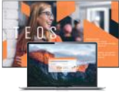
Connect for TEOS license TEC-SC100