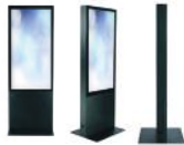
Totems TOT-XXBZ40H-IR10 TOT-XXBZ40H-CA10